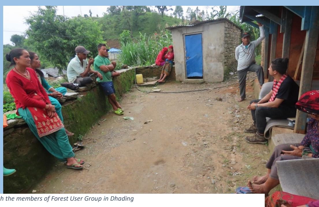
Figure 4: Meeting with the members of Forest User Group in Dhading

After the selection of plantation site, a detailed meeting was organized with the community to share and discuss the plantation process. Time schedule for plantation, tree species selection (native and suitable to the climate and soil type), protection measures and monitoring plans were finalized. A contract was signed between the representatives of FON, Nepal, and plantation management committees in July.