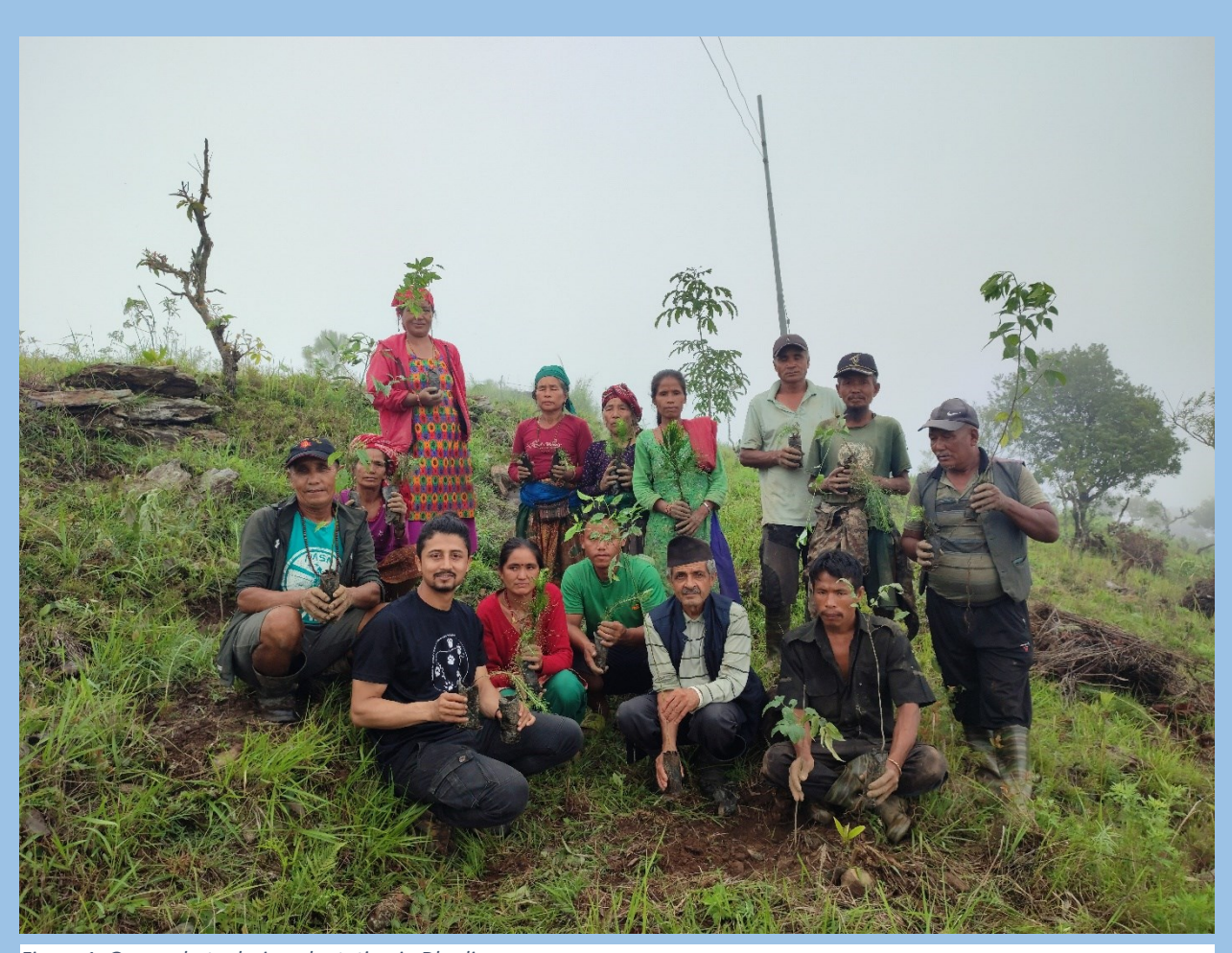
Figure 1: Group photo during plantation in Dhading

Under the agreed 'Trees for Climate, Nature and Society' (TreeCLINS) initiative commenced in 2021, Friends of Nature, Nepal (FON) and Stiftung Unternehmen, Germany collaborated for plantation project in Nepal. Since the commencement a total of 21,250 seedlings have been planted in four districts which is 4,250 more seedlings than agreed. Jurethum from Dhading and Nishan Dadha from Sunsari were selected to be the plantation site for 2023. During the two phases of plantation in Dhading, species like Pine, Himalayan Ash, Walnut and Camphor with other native trees (7000 seedlings) were planted. Likewise, Sal, Indian date, Chinaberry, and other native species (250 seedlings) were planted in Sunsari. The planted seedlings are secured by bamboo sticks in Sunsari, while regular patrolling of the plantation site will be done by locals in Dhading. Plantation committees are very committed and regularly work on the protection of every seedling.