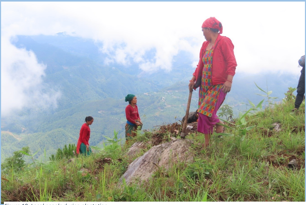
Figure 10: Local people during plantation