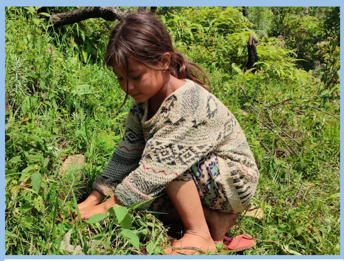
Figure 11: A happy school kid involved in plantation