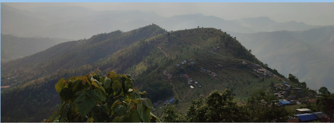
Figure 2: Plantation site, Jurethum: The top of the hill

Nishan Dadha lies in Dharan Sub-metropolitan city ward number 05, about 35 kilometers far from district headquarter Inaruwa. The area can be reached within 10 hours road distance from Kathmandu. The area is at the elevation range of 610 to 630 meters from the sea level in subtropical climatic zone. The plantation was managed by the Research Association Hattisar (RAH), Dharan.