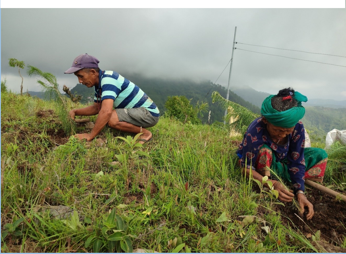
Figure 9: Local people during plantation site in Dhading

The plantation management committee is fully responsible for the protection of plants. In Jurethum, there is a stone wall running through one side of the area and the rest is inaccessible for livestock grazing. The area is not directly used by any communities for fodder collection, which ensures the seedlings are fully protected. The seedling in Nishan Dadha is protected with the help of bamboo sticks. FON Nepal gets regular updates from plantation site and visits the site every two months to see the progress. Furthermore, replantation of dead plants will be conducted following year by the community.