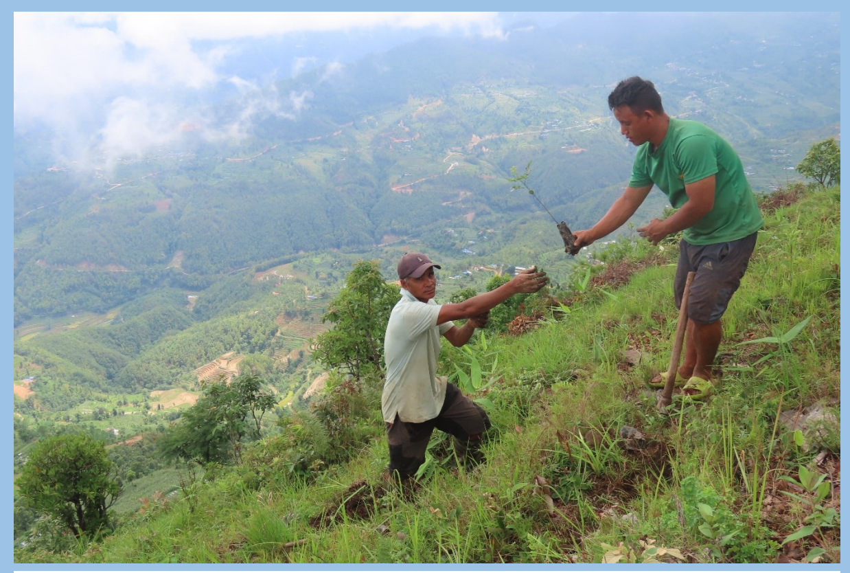
Figure 12: Local people during plantation