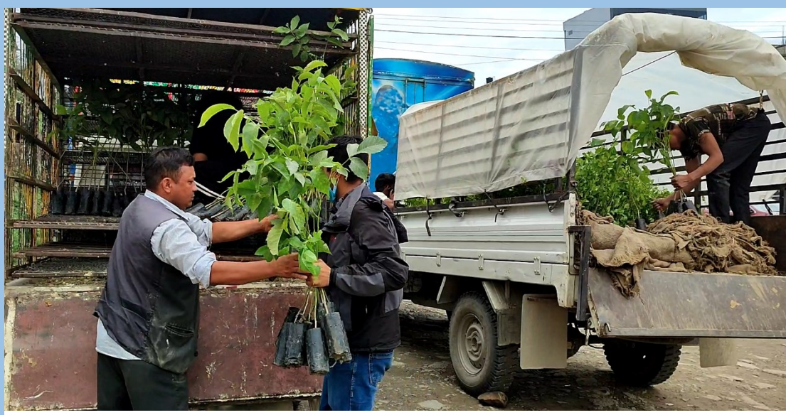
Figure 6: Transportation of seedlings in Dhading

The 7000 seedlings to be planted were transported from Kathmandu and the local nursery of Dhading and Dharan. A total of six/six species were planted in both plantation