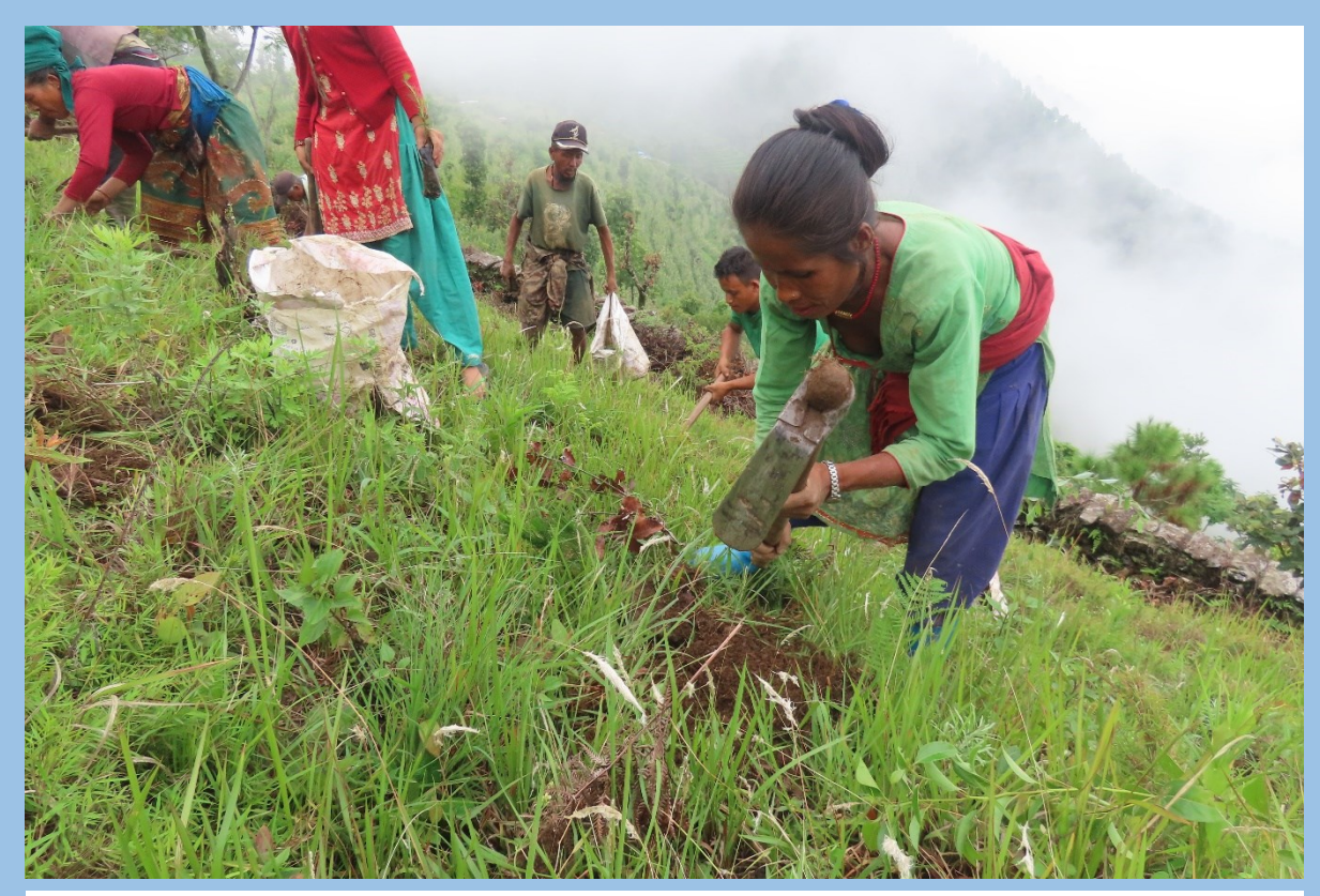
Figure 5: Local people digging pits and cleaning the area

Clearing of the bushes, waste removal and digging of pits was done prior to plantation by local communities. The preparation started 1 week prior to transportation of seedlings.