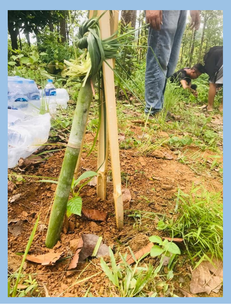
Figure 8: Protection of seedlings from cattle by using local resources