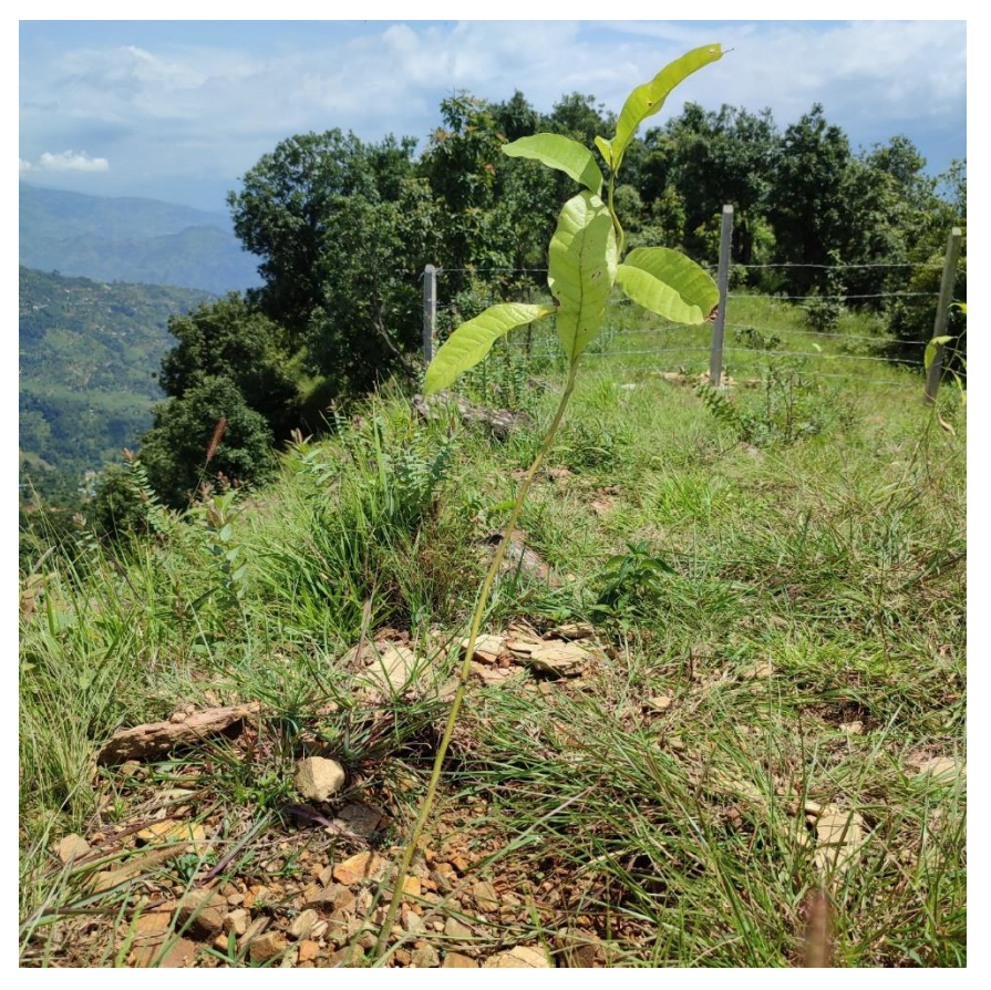
Seedling of the tree growing inside the fencing

Weeding: During the patrolling and as a dedicated activity, the local stakeholders will perform weeding around the planted seedlings.