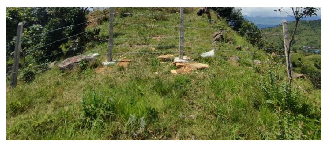
Plantation site in Dhading district were protected by barbed wire fencing Regular patrolling : Local stakeholders will patrol regularly in and around the tree planning sites.

Dhading site: This location was chosen so that there was no need to fence in the entire perimeter. The possible entry point was a barbed wire fenced with concrete pillars.