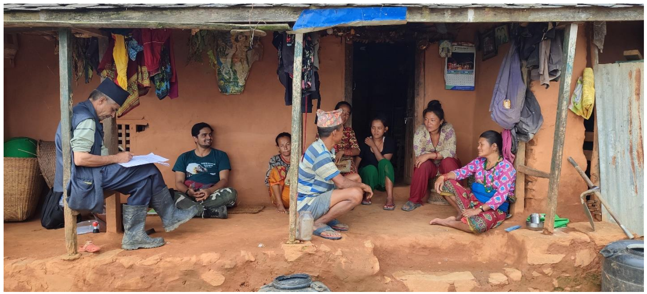
Signing of contract with leader of a local community in Dhading District

A sub-contract was established based on responsibilities of both the parties, and signed between FON Nepal and the local authorities of the tree plantation project.