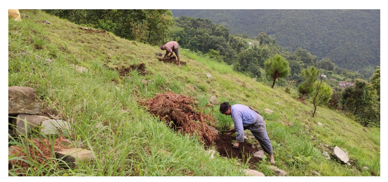
Digging for plantation