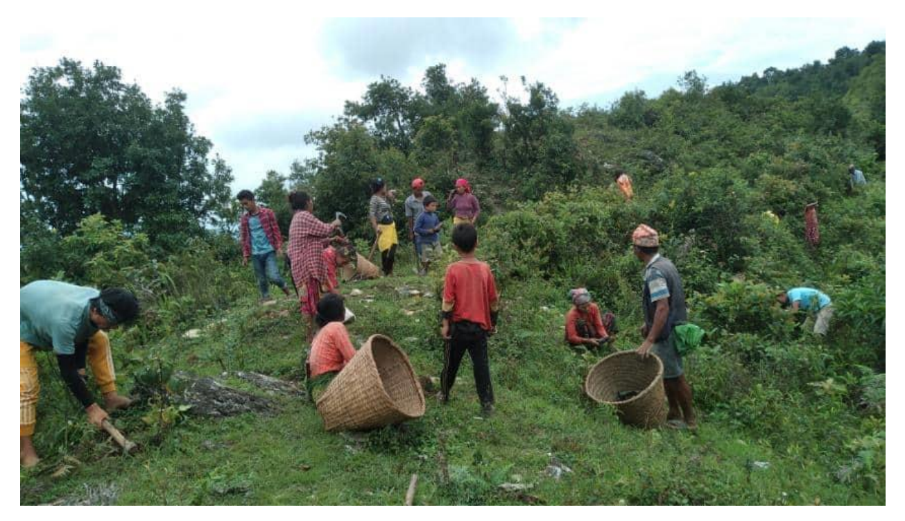
Local people during the cleaning of afforestation site-Dhading