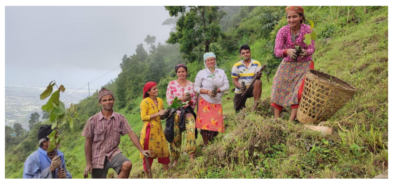
Local people during plantation-Kaski